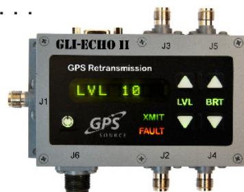
GLI-Echo II LRU