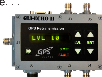
GLI-Echo II LRU